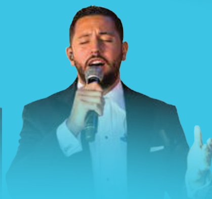
AVI CHRIQUI DELEVANTI