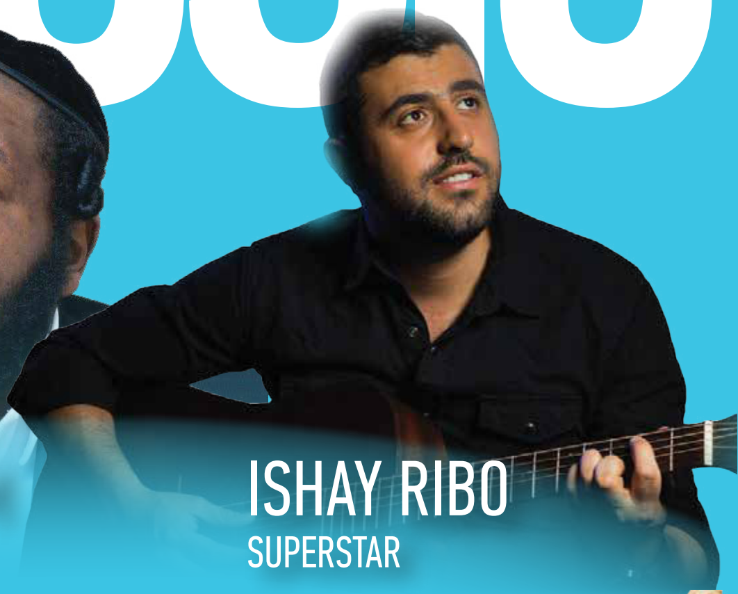
ISHAY RIBO SUPERSTAR