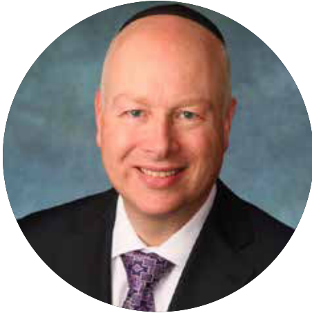
The Honorable JASON D. GREENBLATT SPEAKER

For nearly three years, until the end of October, 2019, Jason Greenblatt served as Assistant to the President and Special Representative for International Negotiations at the White House. Jason was the Trump administration's chief architect of the peace plan between Israel and the Palestinians and Israel and its Arab neighbors.