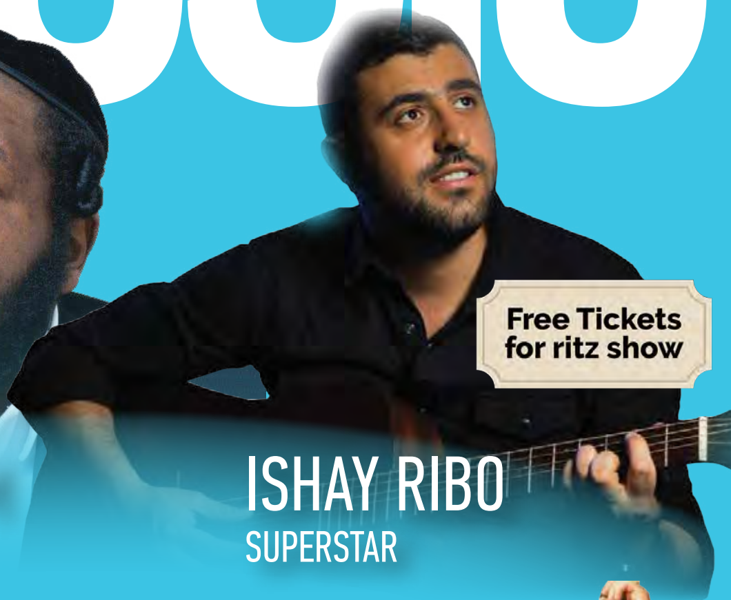
ISHAY RIBO SUPERSTAR